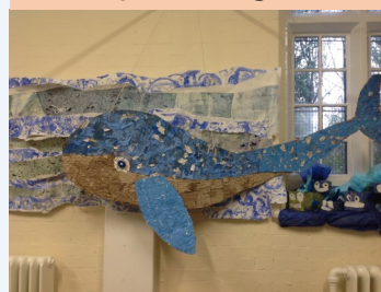
Pre-Prep's amazing whale!

Pre-Prep - Yo ho ho and a bottle of rum! The pirates have landed! What a perfect end to a pirate filled week. We've followed the clues around the school to find treasure and will share the loot between us! We enjoyed making our pirate grog (hot chocolate) and singing pirate songs. But we have to climb onboard again now and sail off to seas unknown! Farewell me hearties!